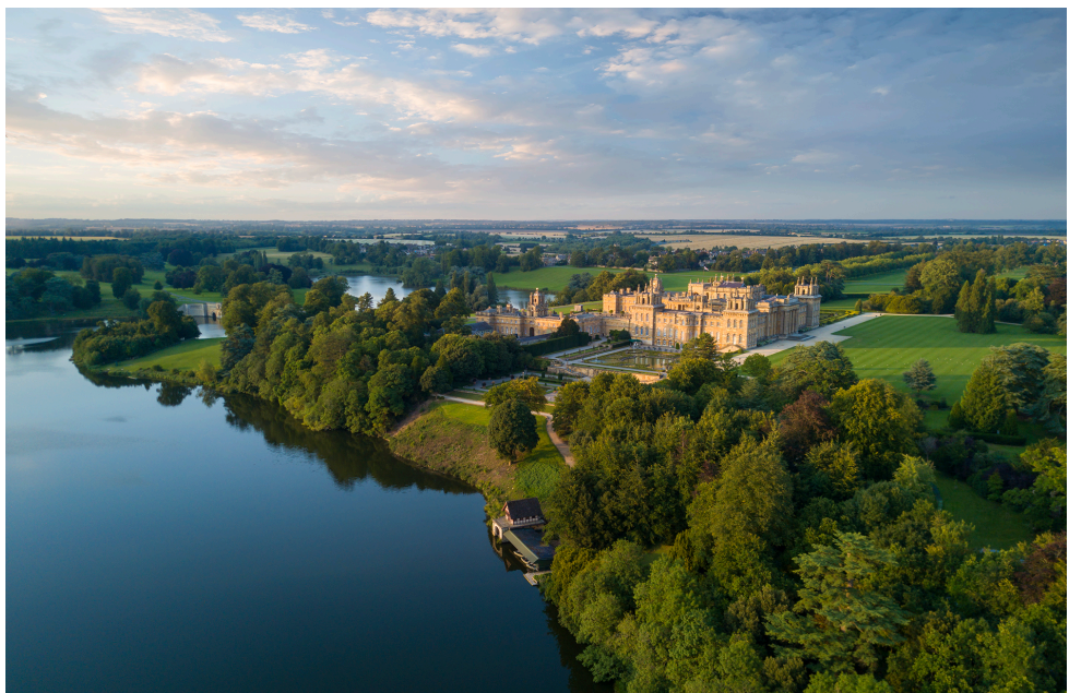
Blenheim palace, Britain's Greatest Palace